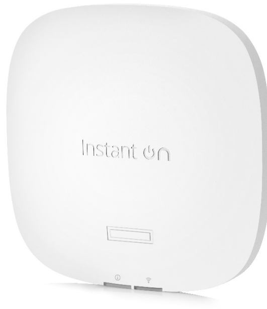
HPE Networking Instant On Access Points AP22

We know the critical role Wi-Fi plays in business today. No business can't afford downtime. The Instant On AP22, at every level, is designed for rapid deployment and simplified management. Be it mounting hardware, or remote device management, or having access to the latest business-grade software, the AP22 lives to make your life easier.