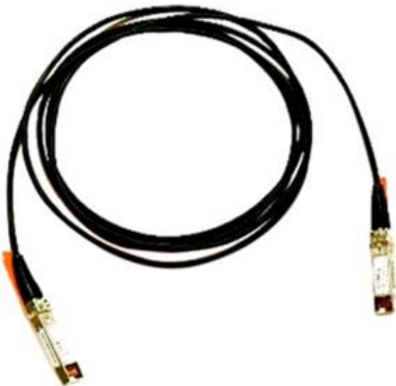
Figure 3. Cisco direct-attach twinax copper cable assembly with SFP+ connectors

Cisco SFP+ Copper Twinax (Figure 3) direct-attach cables are suitable for very short distances and offer a cost-effective way to connect within racks and across adjacent racks. Cisco offers passive Twinax cables in lengths of 1, 1.5, 2, 2.5, 3, 4 and 5 meters, and active Twinax cables in lengths of 7 and 10 meters.