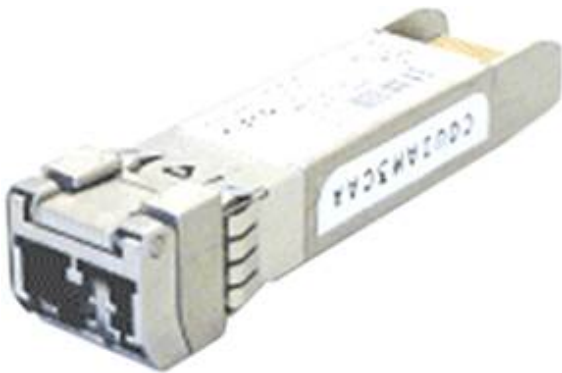
Figure 1. Cisco 10GBASE SFP+ modules

The Cisco ™ 10GBASE SFP+ modules (Figure 1) give you a wide variety of 10 Gigabit Ethernet connectivity options for data center, enterprise wiring closet, and service provider transport applications.