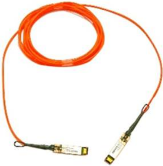
Figure 4. Cisco direct-attach active optical cables with SFP+ connectors